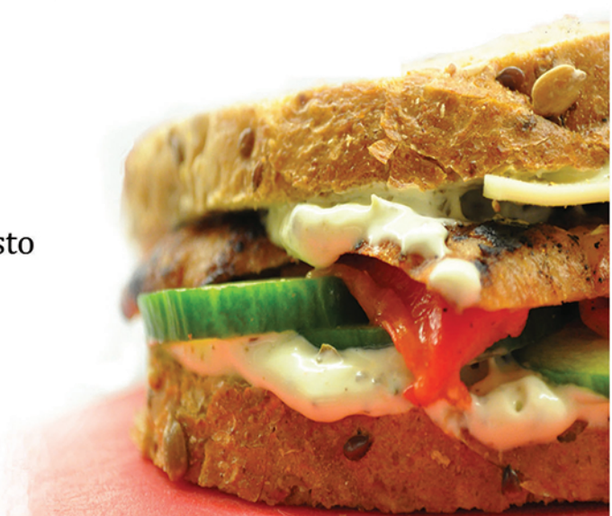
Chicken Pesto Sandwich

Grilled Cheese - Simple, fun and so delicious! Slices of American cheese on whole wheat bread. 365 Cal $5.99